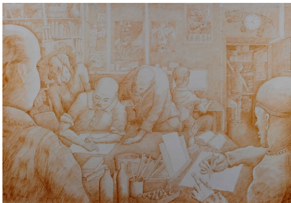
The Art Room Brixton, Anon. HM Prison Brixton. Silver Award for Drawing

Each issue we interview a Koestler Awards entrant about their experience of entering the awards.