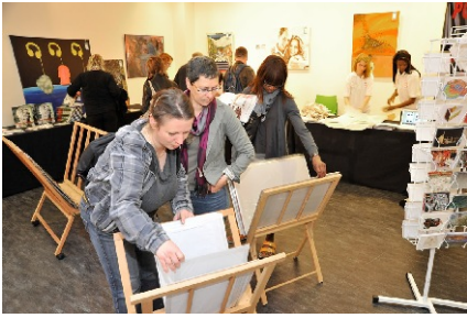
The SERCO Big Art Sale Room

There will be a chance to buy artwork submitted to this year's Koestler awards at the SERCO Pop Up Art Sale, White Room, Spirit Level at Royal Festival Hall 1 – 7pm 16 – 20 November 2011