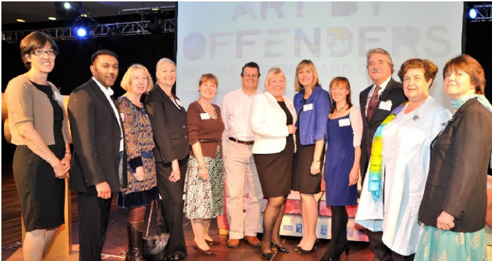
our 2011 curators at the exhibition opening

Each year our UK Exhibition is given a fresh perspective through a group curating project. This year's curators were a group of 12 volunteers from the Magistrates' Association, which is celebrating its 650 th anniversary. As sentencers in the Magistrates' Courts, they have brought their own perspective on the criminal justice system to our 2011 UK Exhibition at Southbank Centre.