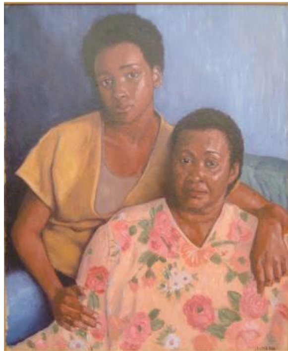
“Left Behind” Acrylic by inmate of HMP Grendon 2006 Koestler Award Winner