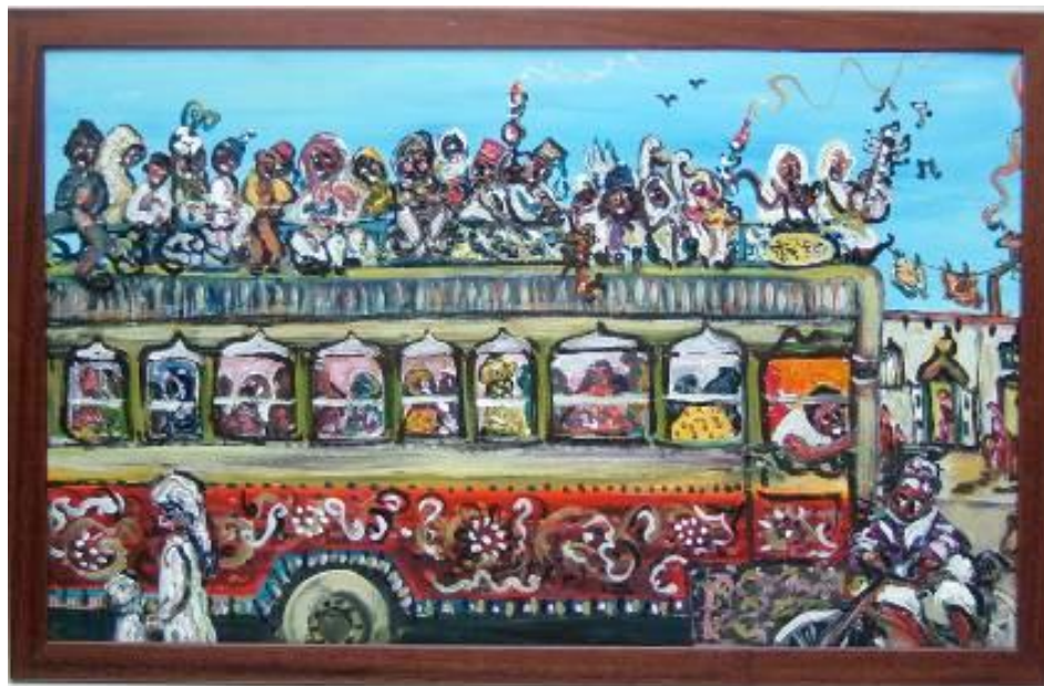
“Bus to Goa” oil painting by inmate of HMP Birmingham 2006 Koestler Award winner

All mentees who participate in the project will be doing so voluntarily.