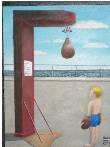
“Time” oil painting by inmate of HMP Shepton Mallet 2006 Koestler Award Winner