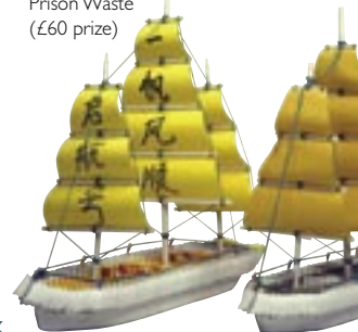
Junk Escape (below) Anon HMP YO1 Chelmsford Rethinking Recycling First Prize for Artwork from Prison Waste (£60 prize)

The Koestler Trust, 168a Du Cane Road, London W12 0TX 020 8740 0333 info@koestlertrust.org.uk www.koestlertrust.org.uk