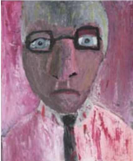
Ages of Style (top left) Anon, Ashworth Hospital Third Prize for Craft from a Special Hospital (£30 prize)

“I cried when I got a Koestler Award. It was the first time in my life I’d been told I’d done something really well.” An award winner