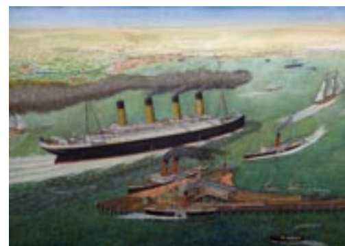
Titanic Passes Ryde Pier (left) Anon, HMP Parkhurst Kalyx Highly Commended Award for Watercolour

Founded in 1962 by Arthur Koestler, author of the prison novel Darkness at Noon , the awards are run by a charitable trust based at HMP Wormwood Scrubs. The Trust has no endowment or capital – we rely entirely on donations and sponsorship.